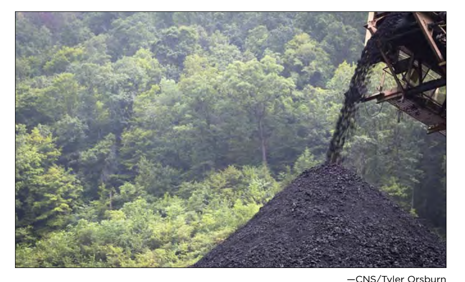
A mound of coal after being processed near Whitesville, W.Va., in August 2014