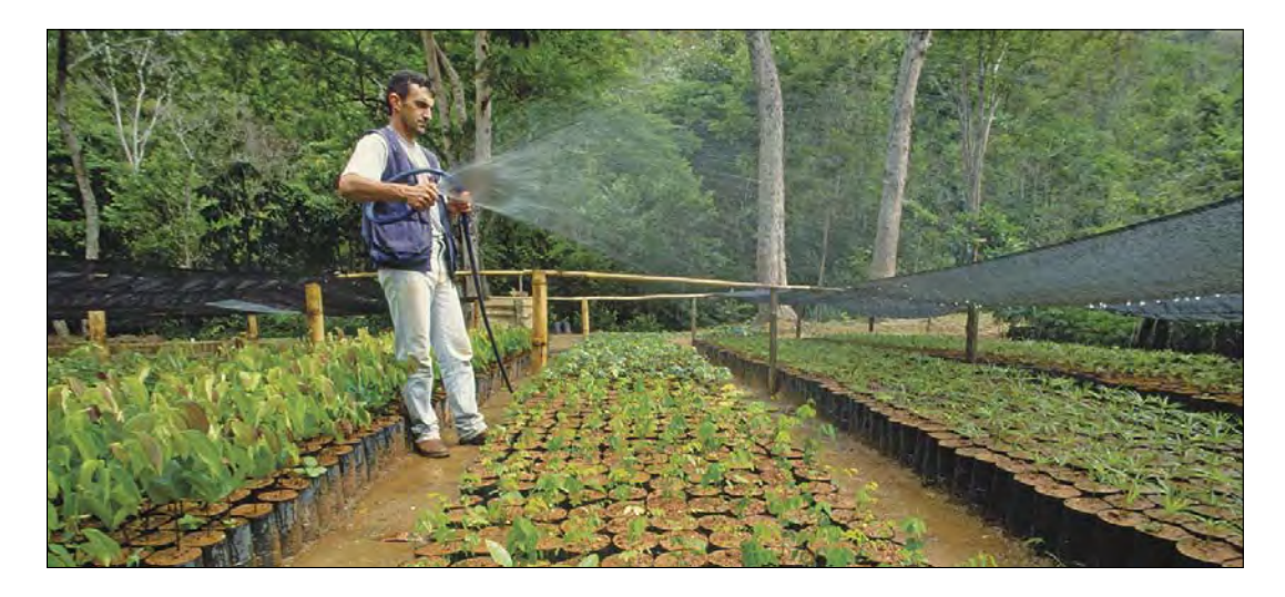
A reforestation nursery in Montes Claros, Brazil

One of the many marvelous things about Pope Francis' encyclical on the environment, "Laudato Si', on Care for Our Common Home," is that it is written in a very accessible style. It does not read like an academic tome as have many encyclicals of the past. Anyone who can read a newspaper can read this encyclical and get something out of it.