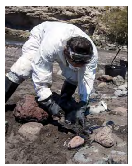
A man collects fuel oil from rocks in April 2015 following an oil spill along Veneguera beach in Spain's Canary Islands.

3. Why does Francis think it is important for us to understand ecosystems and our relationship