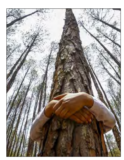
A Nepalese man hugs a tree while celebrating World Environment Day at the forest of Gokarna, on the outskirts of Kathmandu, in 2014.

10. "The Christian tradition has never recognized the right to private property as absolute or inviolable, and has stressed the social purpose of all forms of private property" (93). When can the right to private property be subordinated to the common good?