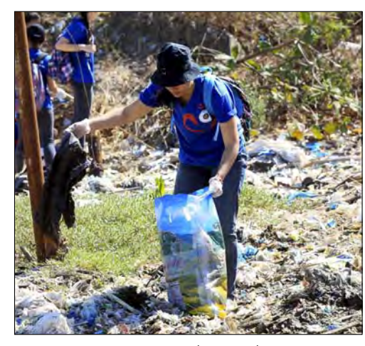
A volunteer picks up trash at Freedom Island, a marshland considered to be a sanctuary for birds, fish and mangroves, in the Philippines in April 2015.

11. What was the attitude of Jesus toward creation (96-100)?